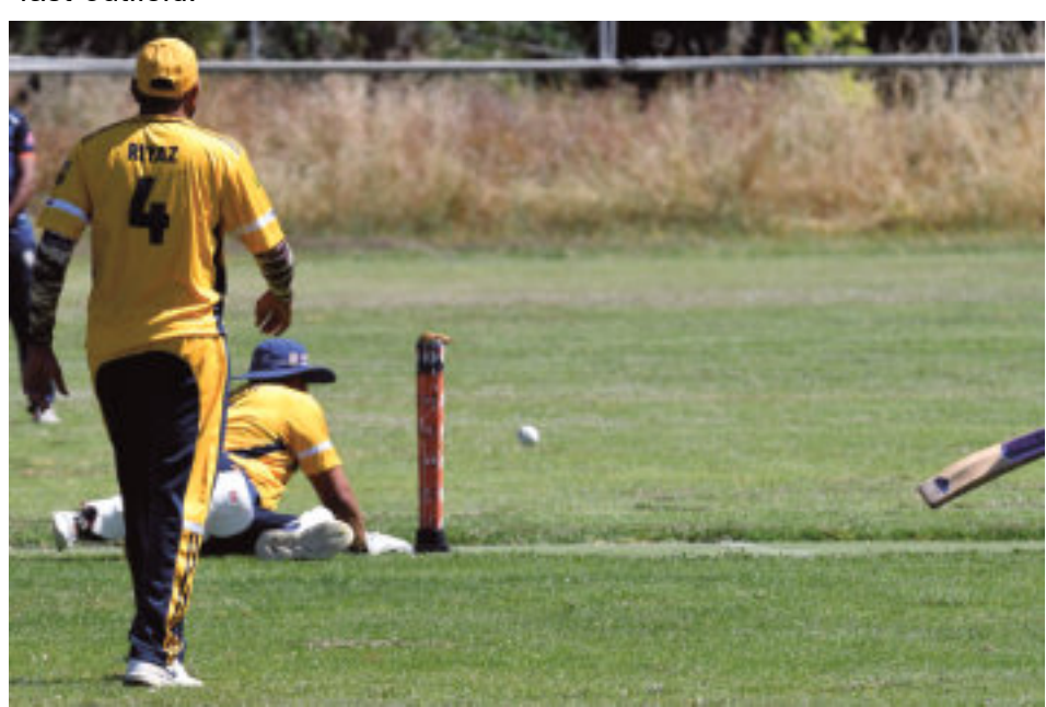
DRS? Bail is dislodged while the bat is raised - excellent umpiring - this close call was given out

The teams therefore met again in the final, but this time it was a