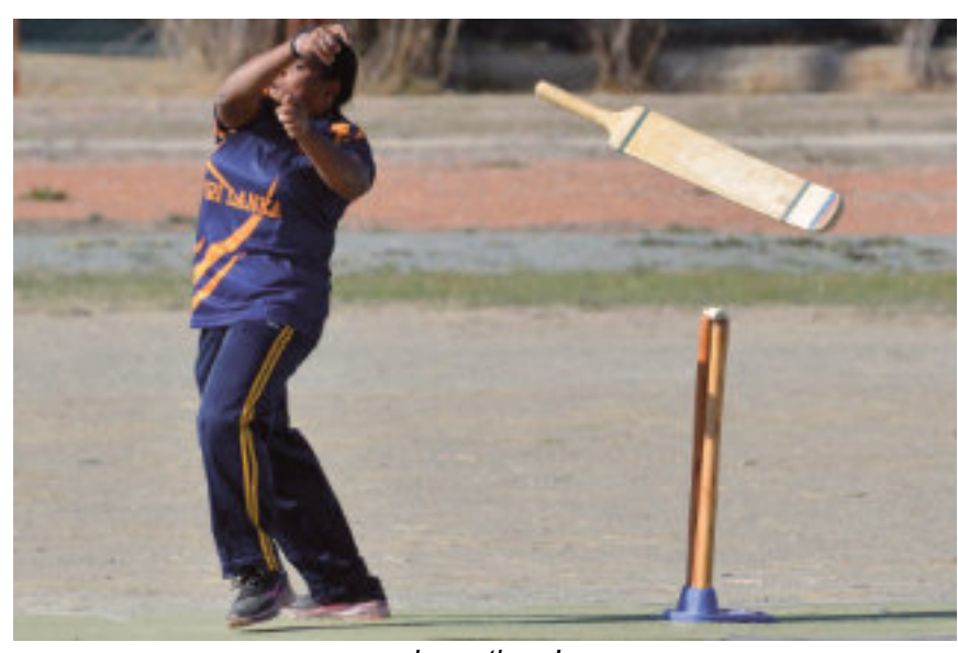
I was there!

I have to admit I was a bit disappointed that the captain didn't give me a second