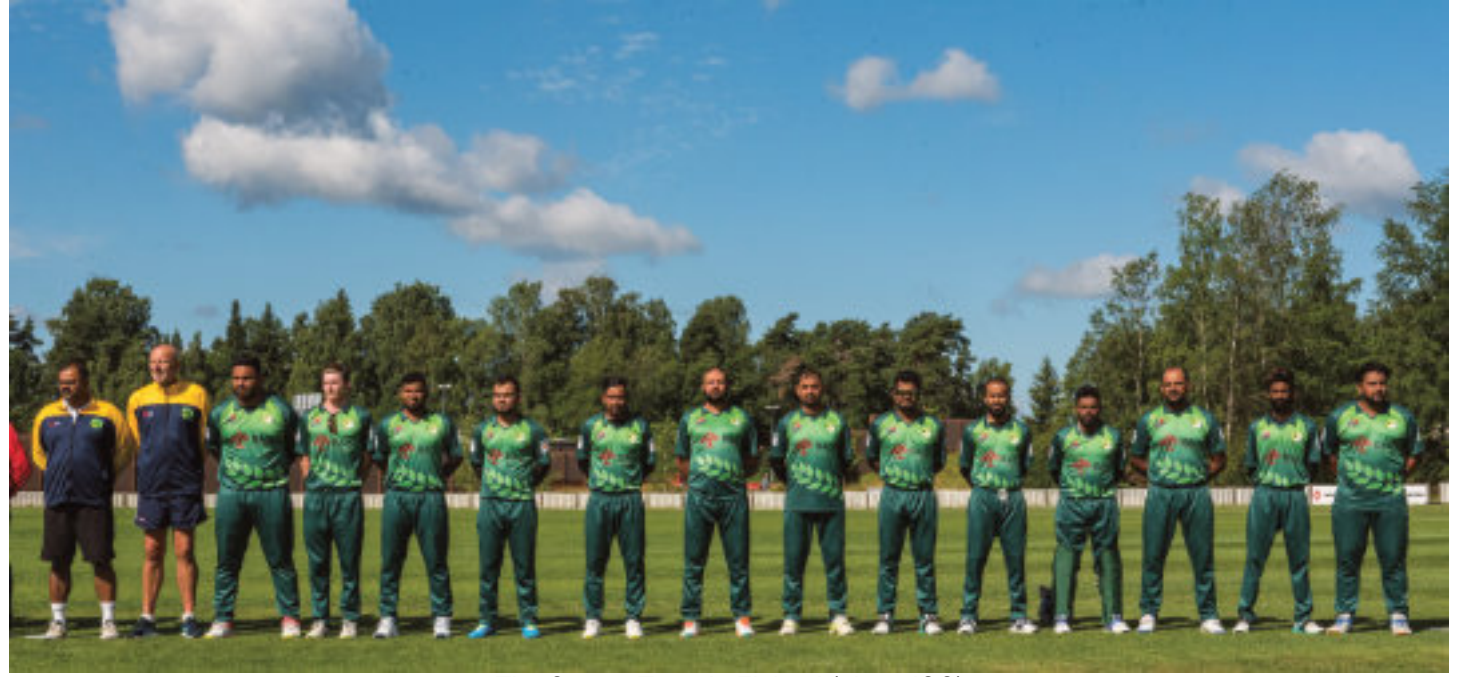
The Cyprus Team in Finland

The Newsletter of the Cyprus Cricket Association www.cypruscricket.com twitter.com/cypruscricket